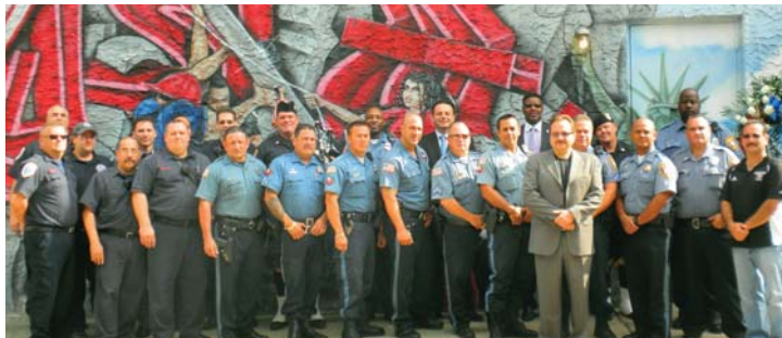
Memorial Service Commemorating the 10th Anniversary of 911