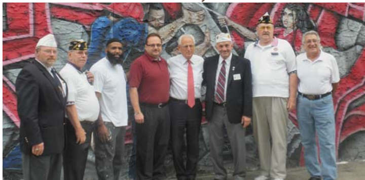
Dedication Ceremony of the 911 Mural at 33 Beckwith Avenue