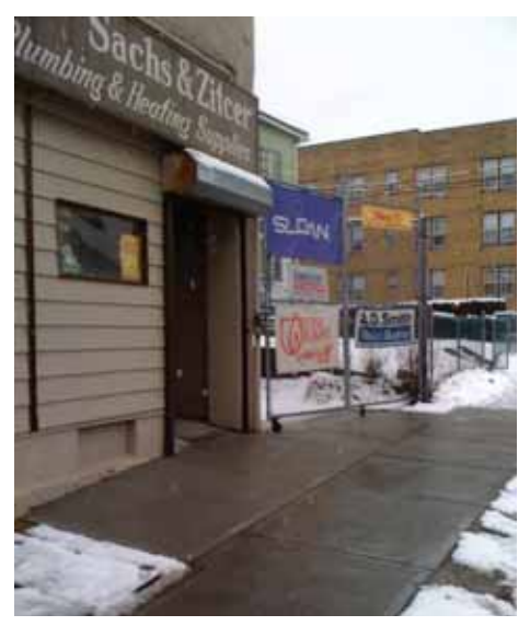
Sachs & Zitcer 389 Tenth Avenue

Superior of the sidewalk applications. "Being a heating supply company, this show melt system served two purposes. First, the sidewalks will never have to be shoveled or salted again; therefore, greatly increasing the life of the concrete. Secondly, it demonstrates this new concept to other businesses and customers who are inquisitive as to what type of snow melt we use on our sidewalks. The neighboring businesses were burdened with the task of shoveling their sidewalks numerous times this past winter, and we never once lifted a shovel to rid the sidewalk of dangerous snow and ice," stated owner Robert Adamo.