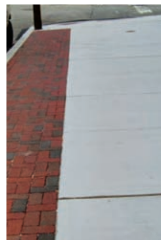
PMA 21 LLC at 318 21 st Avenue