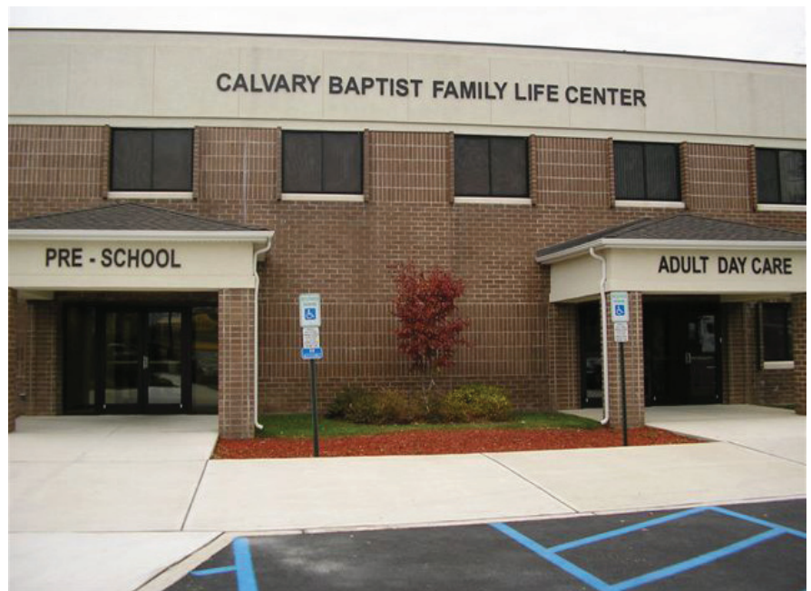
Calvary Baptist Family Life Center

The Business Improvement Grant Program is available for all commercial and mixed commercial use properties with the Paterson UEZ boundaries, excluding Main Street. Business and property owners are eligible for a 50% matching grant up to $35,000 per business. Qualified improvements include minor improvements of lower and upper facades; rehabilitation of historic details; signage; awnings; lighting; security gates, fencing and landscaping. All restoration, rehabilitation and new construction projects must conform to the UEZ Façade Improvement Guidelines as well as the Department of Interior Standards of Rehabilitation.