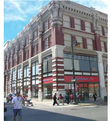
Quackenbush Building Main St. & Ellison St.

The Main Street Façade Program is eligible for all commercial and mixed use properties with frontage on Main Street, from Crooks Avenue to Memorial Drive. All property and business owners are eligible for a 50% matching grant up to $50,000 per building. Qualified improvements include major repairs and improvements to storefronts and upper faces; rehabilitation of historic details; signage; awnings; lighting; security gates; fencing and landscaping. A full block of applicants will receive a 70% matching grant, up to $50,000 per business. All restoration, rehabilitation and new construction projects must conform to the UEZ Façade Improvement Guidelines as well as the Department of Interior Standards for Rehabilitation.