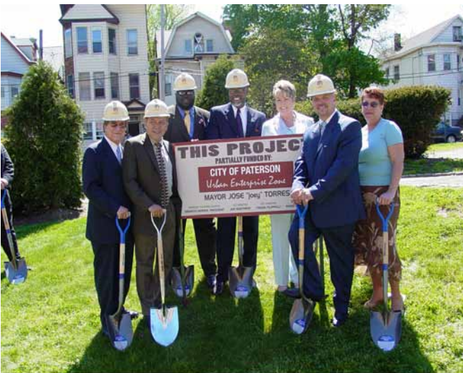
St. Joe's Plaza

Paterson Urban Enterprise Zone has been very busy. We encourage everyone to contact the Paterson UEZ with any questions you may have about existing programs, applications and forms. Please note we moved our offices to 2 Market Street (Paterson Museum). Stop by and visit us. We are here to help you!